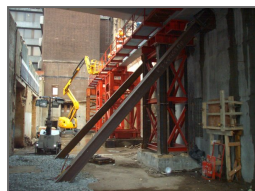
Blackfriars Thameslink Project - Bridge 410E Replacement UK

Country: UK Client: Balfour Beatty Construction Value: £500,000