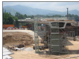
San Tin Interchange Viaduct

Country: UK Client: Costain Construction Value: £500,000,000