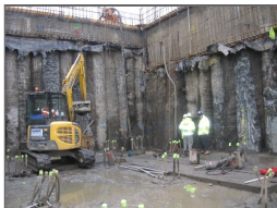
Riverside Resource Recovery (RRR) Energy from Waste Facility

Country: Hong Kong Client: TGP / MHYH Joint Venture Construction Value: HK$2.76 billion