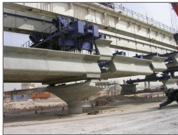
Dubai LRT temporary Works

Country: U.A.E Client: Atkins/ JTM Joint Venture Construction Value: