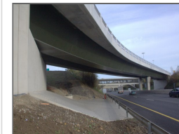
M50 PPP Upgrade - Structure S13-N3

Country: Hong Kong Client: Atkins/ Chun Wo Construction Ltd. Construction Value: HK $500,000,000