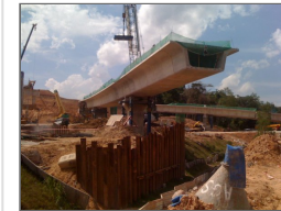
New Palace Interchange

Country: UK Client: Neary Construction Construction Value: