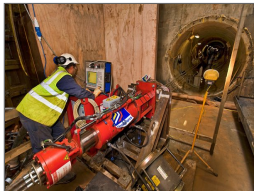
River Exe Gas Pipeline Installation

Country: Malaysia Client: H & T Associates Sdn Bhd Construction Value: