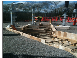
Uskmouth and Swansea North Substation trenches

Country: U.A.E Client: Atkins/ JTM Joint Venture Construction Value: