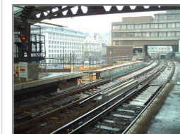
Blackfriars Thameslink Project - Temporary Rail Bridge

Country: UK Client: Balfour Beatty Civil Engineering Ltd Construction Value: