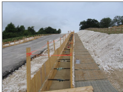
Bramley - Didcot 400kV Cable Replacement Scheme

Country: Malaysia Client: Ranhill Construction Value: