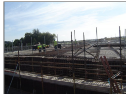
M3 Bridge S20, Detailed Design

Country: UK Client: Neary Construction Construction Value: £500,000