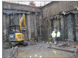
Riverside Resource Recovery (RRR) Energy from Waste Facility

Country: Sri Lanka Client: Kumagai Gumi Co. Ltd Construction Value: US$250,000