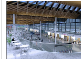
MTR Shatin Central Line, Hung Hom Station Detailed Design.

Country: Ireland Client: ROD (Dublin) Construction Value: £1,500,000